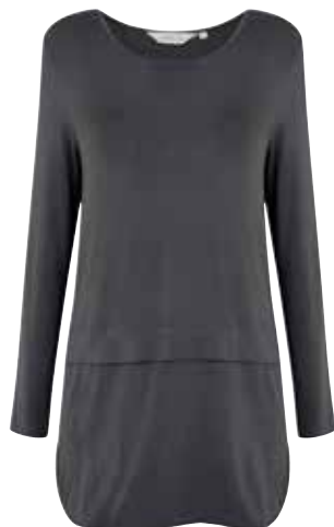
BAMBOO TIERED LONG SLEEVE TOP ASQ/AW/39