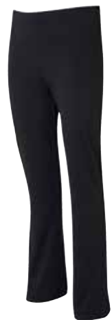
ORGANIC COTTON BOOTLEG PANTS ASQ/AW/30