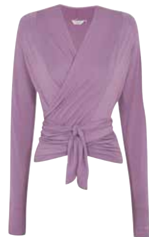
BAMBOO WRAP CARDIGAN ASQ/AW/06