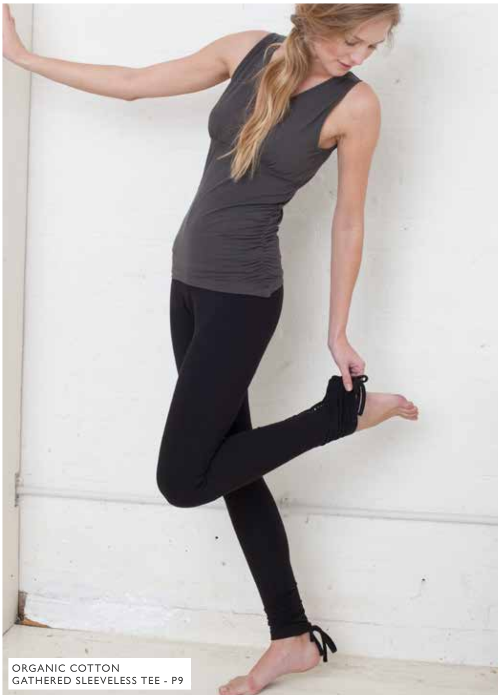
ORGANIC COTTON GATHERED SLEEVELESS TEE - P9