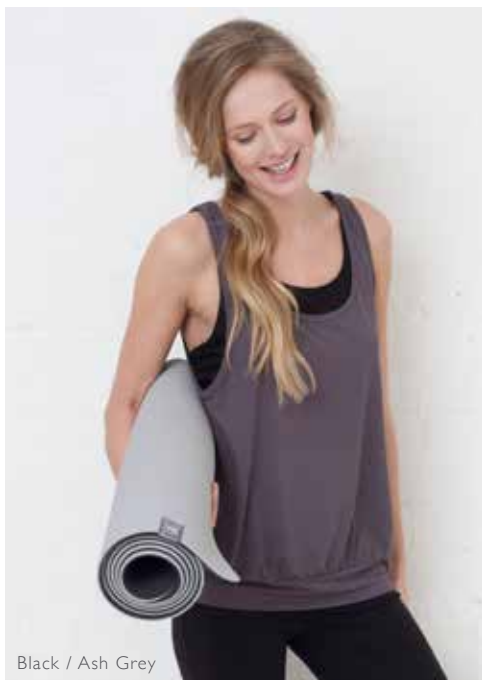
Black / Ash Grey