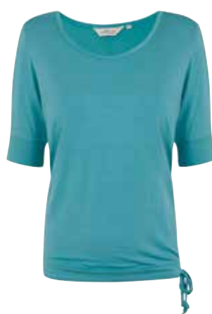
BAMBOO TIE BLOUSON TEE ASQ/AW/45