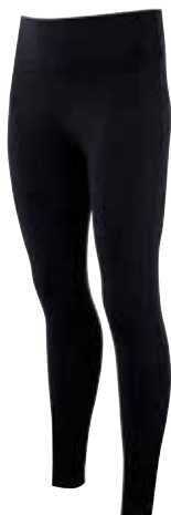
ORGANIC COTTON LEGGINGS ASQ/AW/40