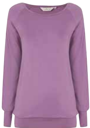
BAMBOO EASY LONG SLEEVE TOP ASQ/AW/37