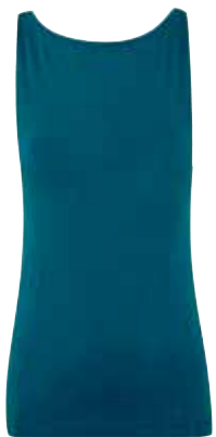
ORGANIC COTTON SLEEVELESS BOATNECK WITH FITTED BRA ASQ/AW/15