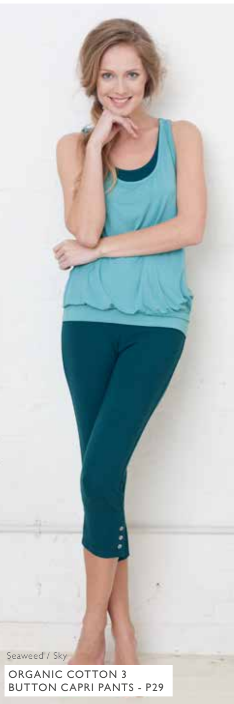
Seaweed / Sky