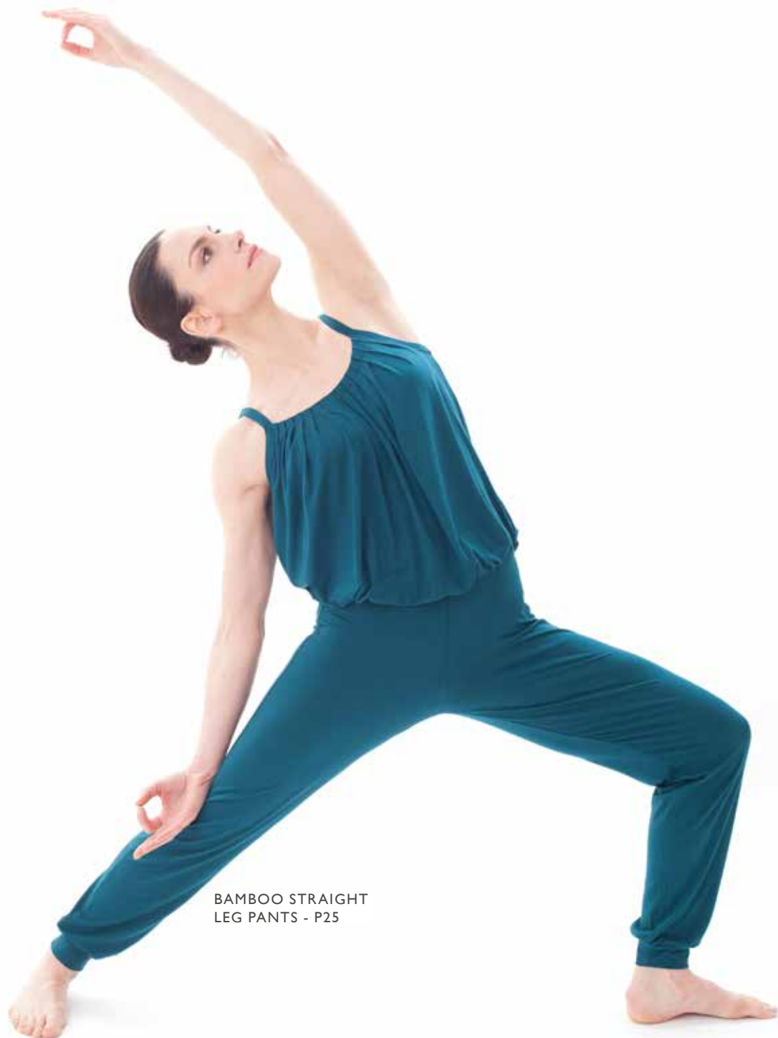
BAMBOO STRAIGHT LEG PANTS - P25