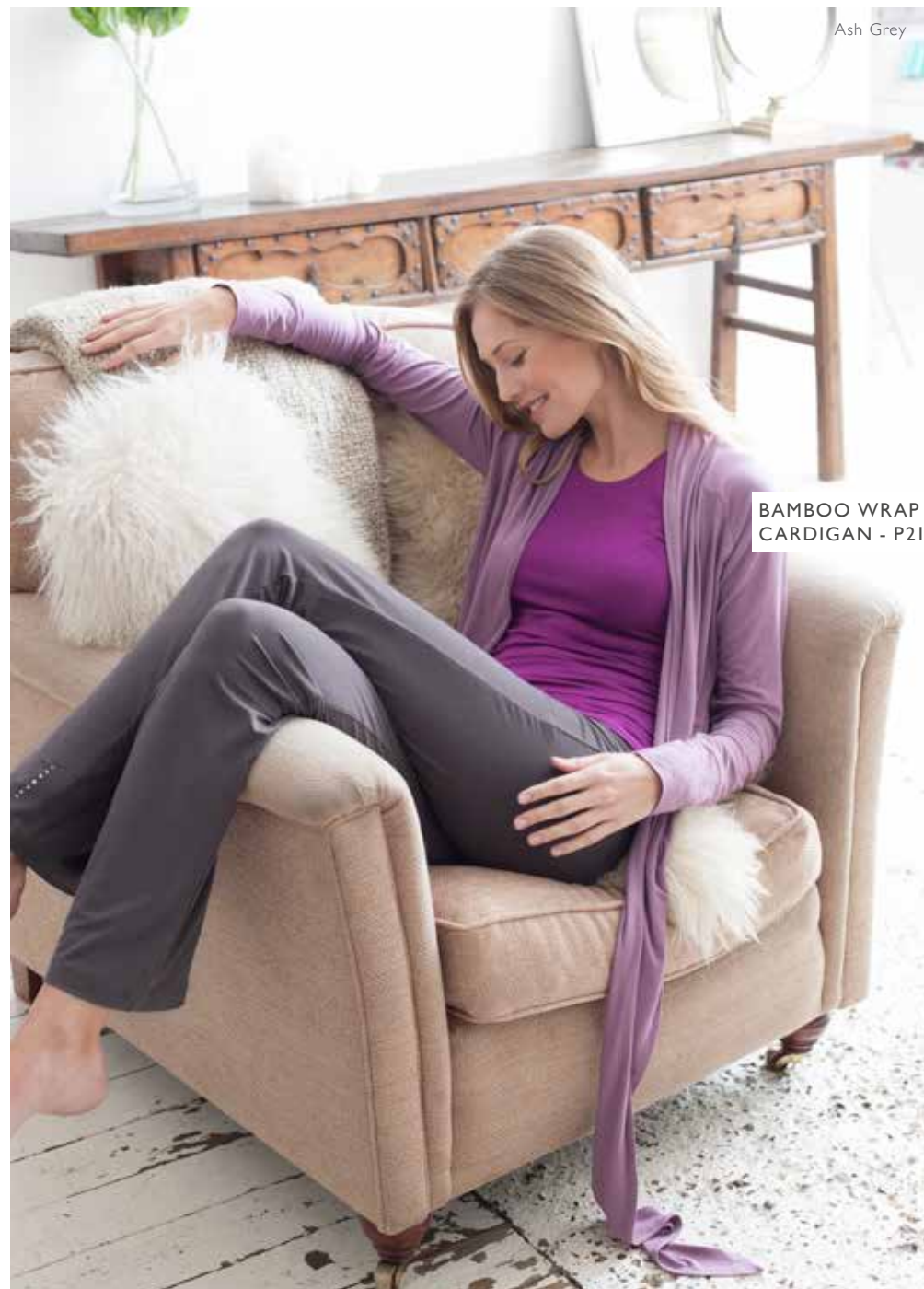
BAMBOO WRAP CARDIGAN - P21