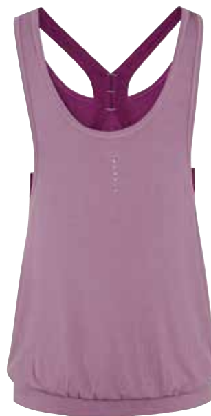
Geranium / Heather