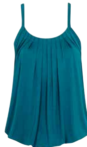
BAMBOO STRAPPY TOP ASQ/AW/29