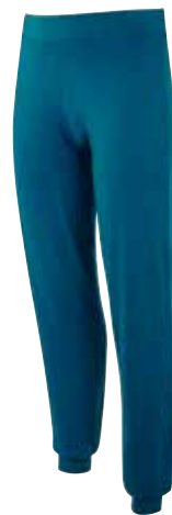
BAMBOO STRAIGHT LEG PANTS ASQ/AW/44