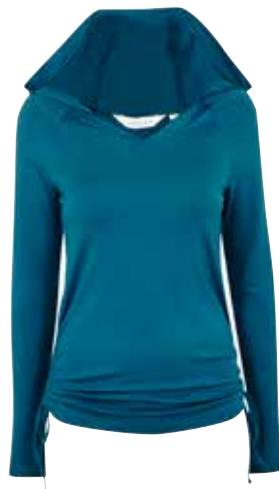
BAMBOO GATHERED HOODY ASQ/AW/36