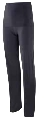
BAMBOO FOLDOVER PANTS ASQ/AW/14