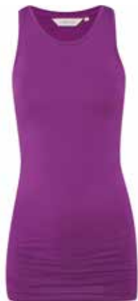
BAMBOO VEST ASQ/AW/35