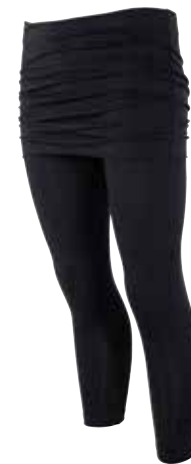
BAMBOO FOLDOVER LEGGINGS ASQ/AW/25