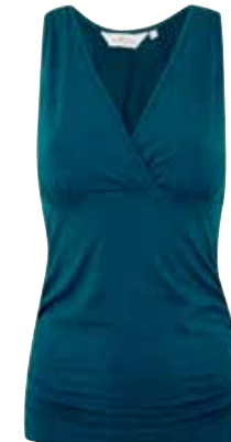
ORGANIC COTTON GATHERED SLEEVELESS TEE ASQ/AW/28