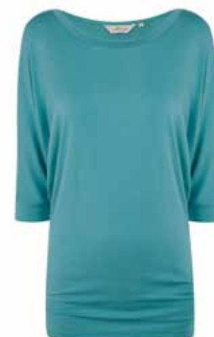
BAMBOO RAGLAN SLEEVE TOP ASQ/AW/07