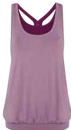
LAYERED BRA TOP ASQ/AW/34