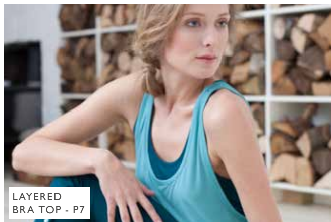
LAYERED BRA TOP - P7