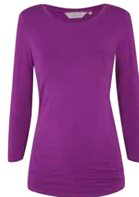
BAMBOO 3/4 SLEEVE TEE ASQ/AW/38