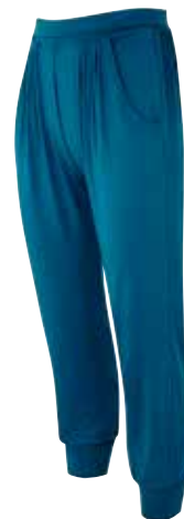
BAMBOO HAREM PANTS ASQ/AW/27