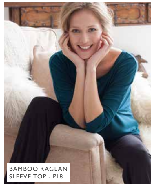
BAMBOO RAGLAN SLEEVE TOP - P18