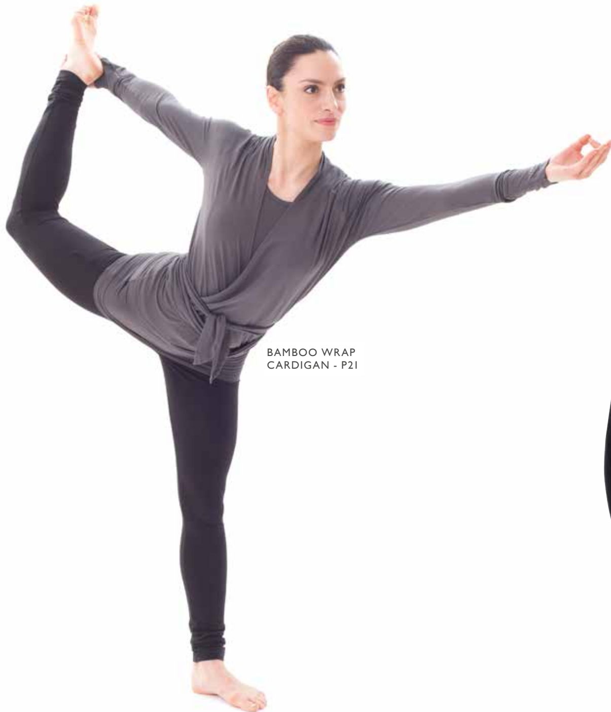
BAMBOO WRAP CARDIGAN - P2I