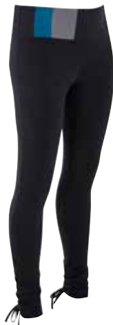
ORGANIC COTTON ANKLE TIE LEGGINGS ASQ/AW/42