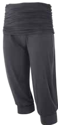
BAMBOO GATHERED CROP PANTS ASQ/AW/05