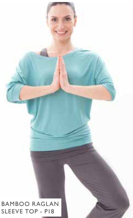
BAMBOO RAGLAN SLEEVE TOP - P18