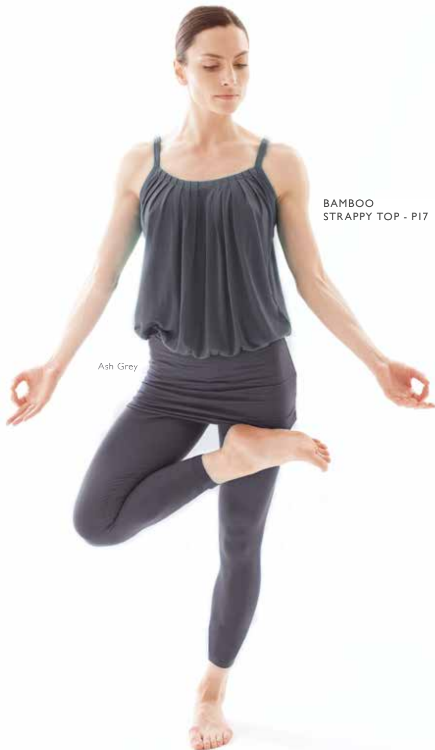
BAMBOO STRAPPY TOP - PI7