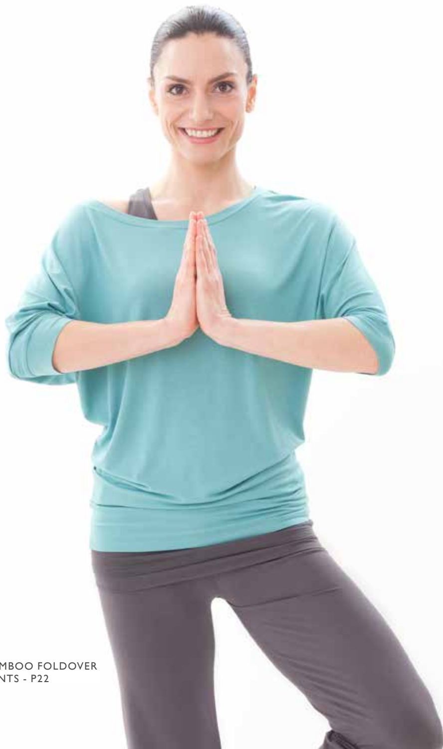
BAMBOO FOLDOVER PANTS - P22