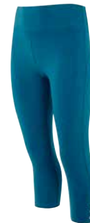
ORGANIC COTTON 3 BUTTON CAPRI PANTS ASQ/AW/47