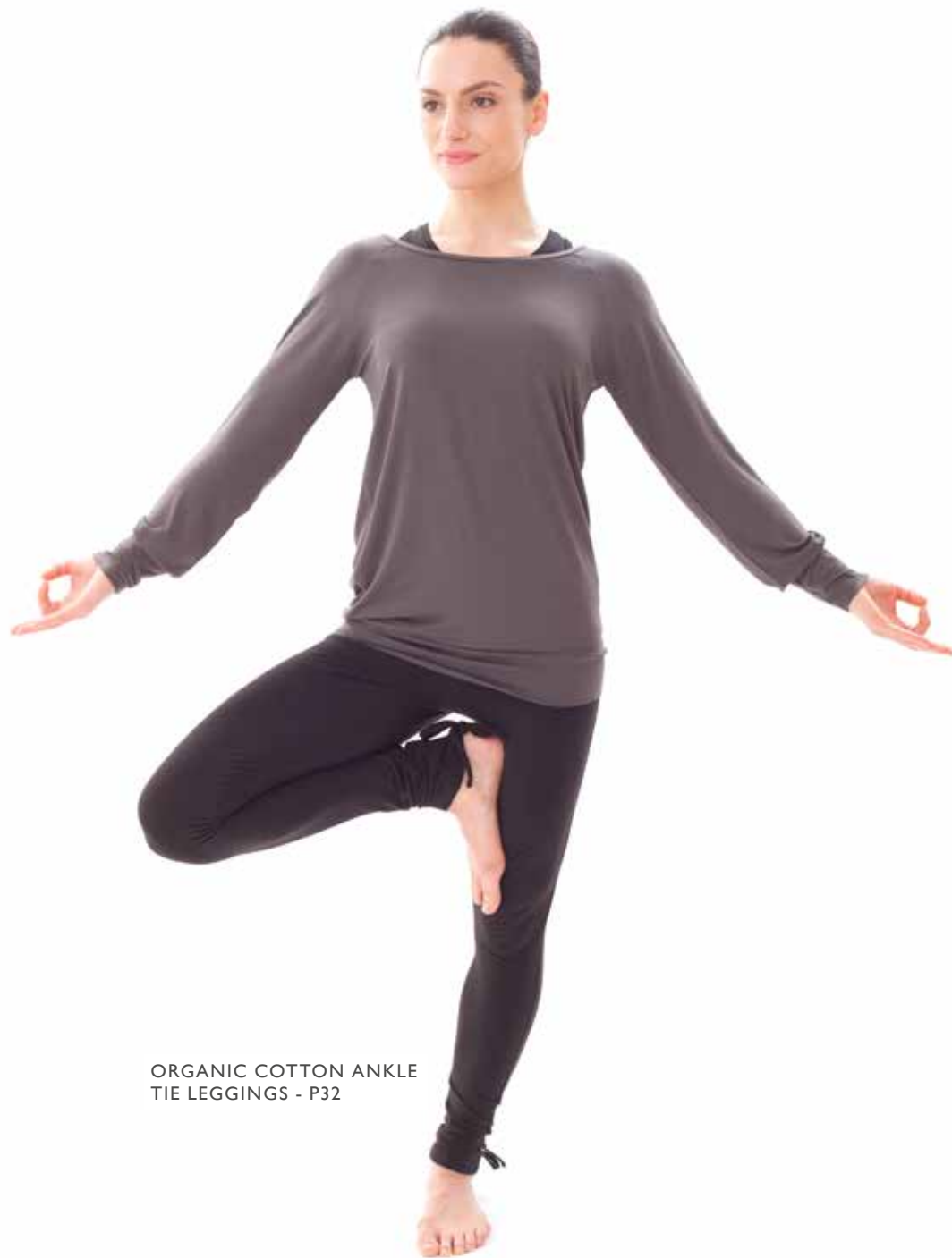
ORGANIC COTTON ANKLE TIE LEGGINGS - P32