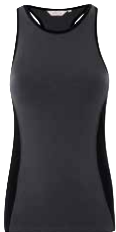
ORGANIC COTTON RACER BACK TOP ASQ/AW/31