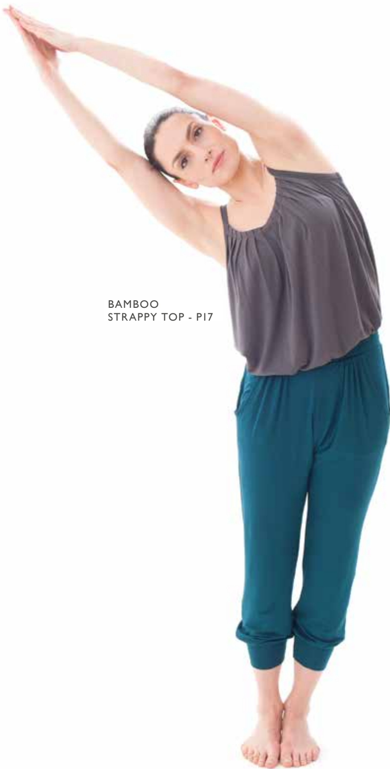
BAMBOO STRAPPY TOP - PI7