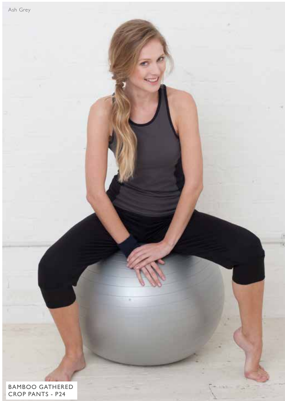
BAMBOO GATHERED CROP PANTS - P24