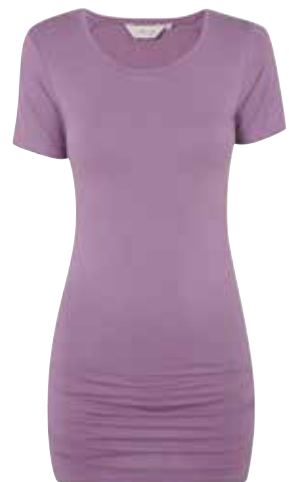
BAMBOO SHORT SLEEVE TEE ASQ/AW/13