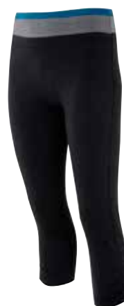
ORGANIC COTTON GATHERED 7/8 PANTS ASQ/AW/43