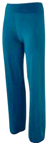
BAMBOO TIE PANTS ASQ/AW/09