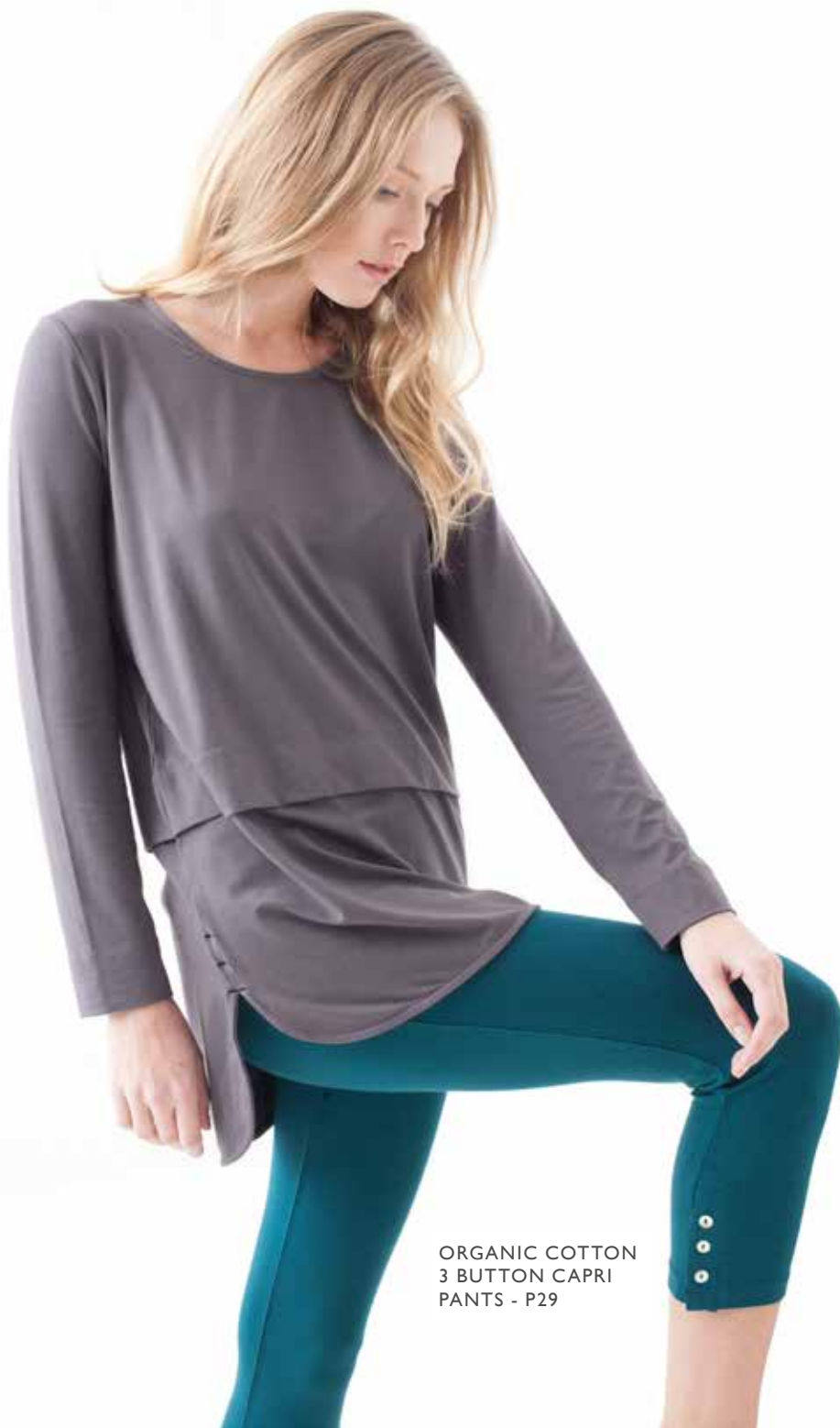
ORGANIC COTTON 3 BUTTON CAPRI PANTS - P29